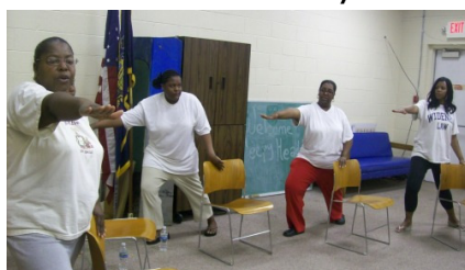
Patrons practice yoga moves at the library.

Crozer Library patrons have been working up a sweat all month long with Fit for Life programs. Participants have line danced, learned exercises from the Arthritis Foundation, and experienced both yoga and Pilates.